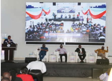
GENERAL SECRETARY DELIVERING HIS ADDRESS