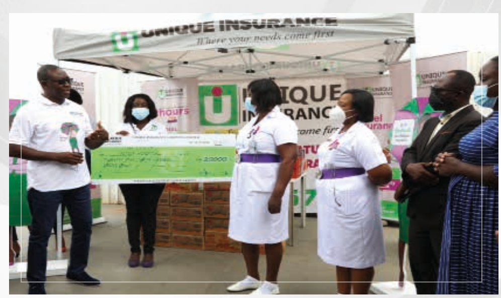
UIC STAFF PRESENTING A CHEQUE TO A BENEFICIARY

ur astute board members are highly skilled and well exposed. This body, coupled with the dynamism of Management and their level of expertise, gives us the confidence to grow the Unique brand. Another strength, as a company, is the youthfulness of our human resource and their technical capabilities, making us an agile company. The delivery of our policies through digitized and controlled conventional means, make them easily accessible. Our unrivalled MOTOR INSURANCE POLICY comes with free towing service for comprehensive policy holders and the payment of minor claims within two hours. These have positioned us as a strong force in Motor insurance underwriting.