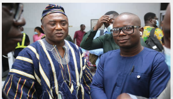
GENERAL SECRETARY WITH THE NATIONAL PRESIDENT