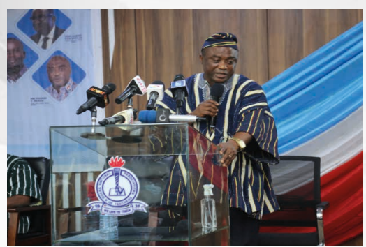
GENERAL SECRETARY MAKING AN INPUT