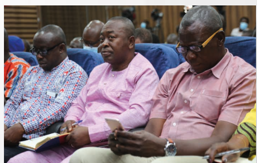
PARTICIPANTS LISTENING ATTENTIVELY