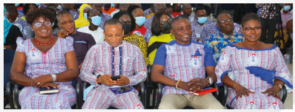
NATIONAL VICE PRESIDENT • NATIONAL TREASURER • 1ST NATIONAL TRUSTEE • 2ND NATIONAL TRUSTEE