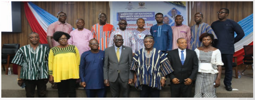
LEADERSHIP OF GNAT WITH MAJOR GENERAL FRANCIS ADU-AMANFO (RTD), NATIONAL SECURITY COORDINATOR