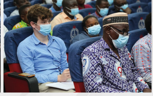
MORE OF THE PARTICIPANTS