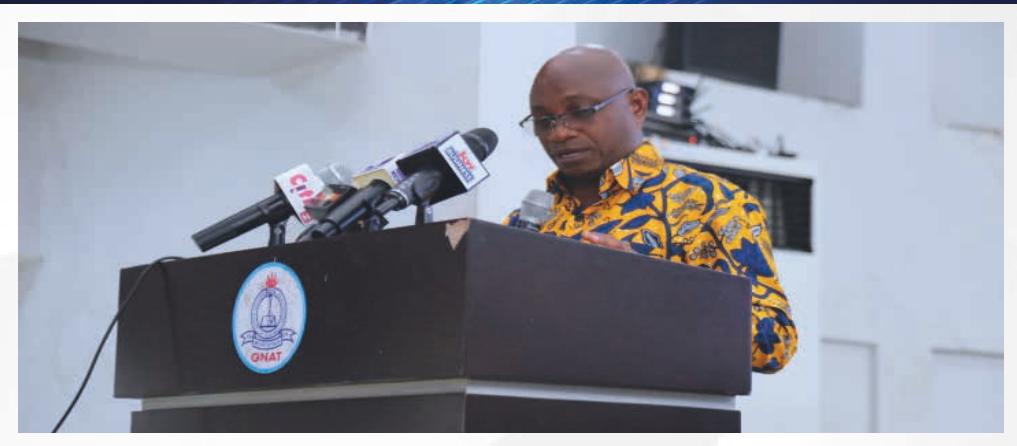
HON. BRIGHT WIREKO-BROBBY, DEPUTY MINISTER, EMPLOYMEMT & LABOUR RELATIONS ADDRESSING PARTICIPANTS